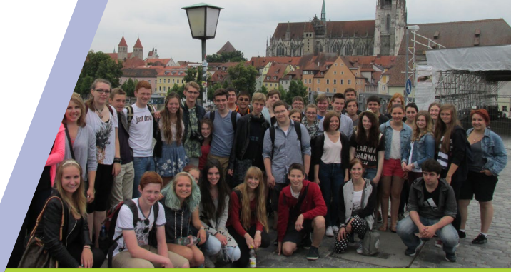
Nicolet students on a German American Partnership Program (GAPP) trip in 2018.