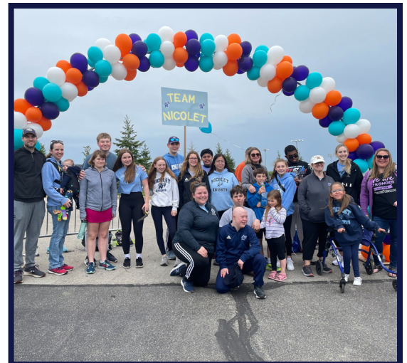
Nicolet Best Buddies at the annual Best Buddies Wisconsin Friendship Walk.