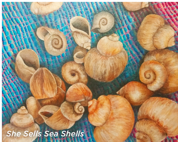
She Sells Sea Shells

Angelo Spolar won Best in Show with the oil pastel drawing The Maker