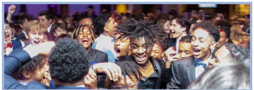
Students dancing the night away at prom.