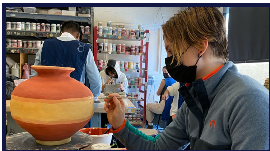
A student in ceramics class prepping their work for firing.