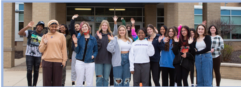
Students pose for a picture outside of Nicolet Union High School.