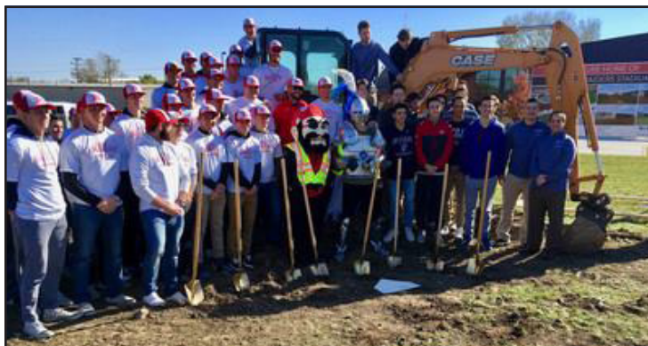
Nicolet and MSOE baseball teams at the Maslowski Park groundbreaking