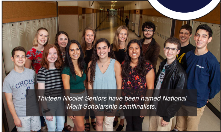
Thirteen Nicolet Seniors have been named National Merit Scholarship semifinalists.