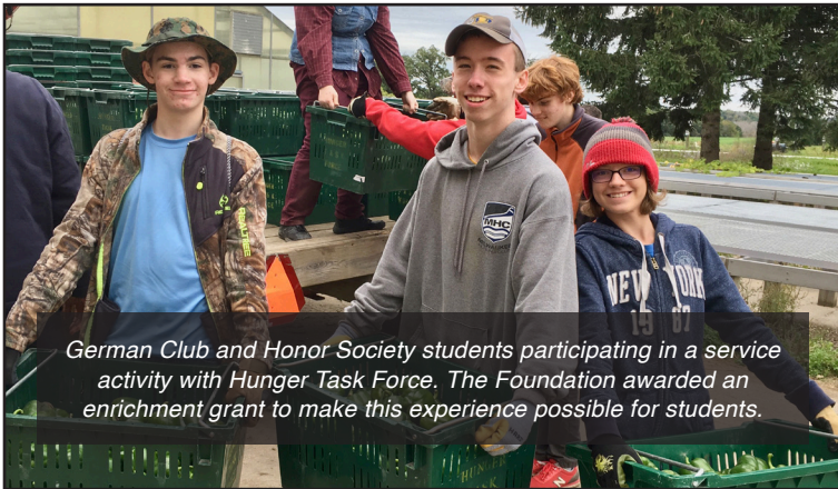
German Club and Honor Society students participating in a service activity with Hunger Task Force. The Foundation awarded an enrichment grant to make this experience possible for students.