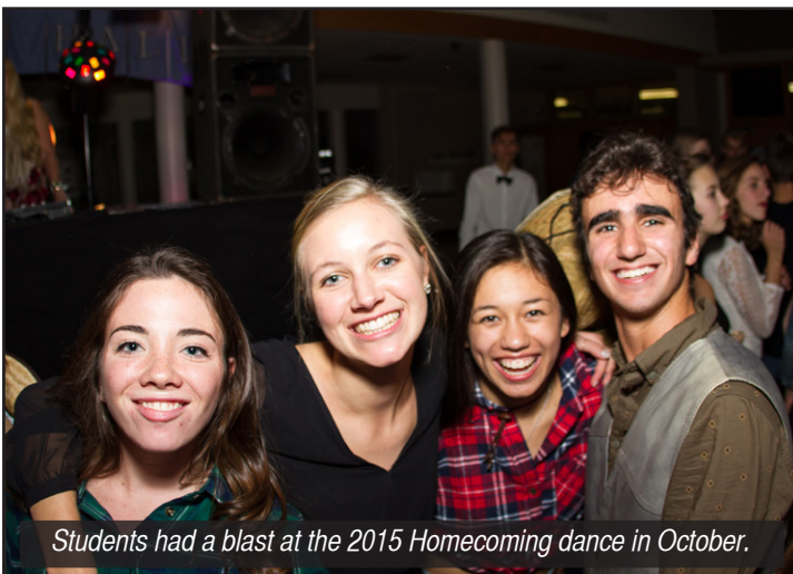
Students had a blast at the 2015 Homecoming dance in October.