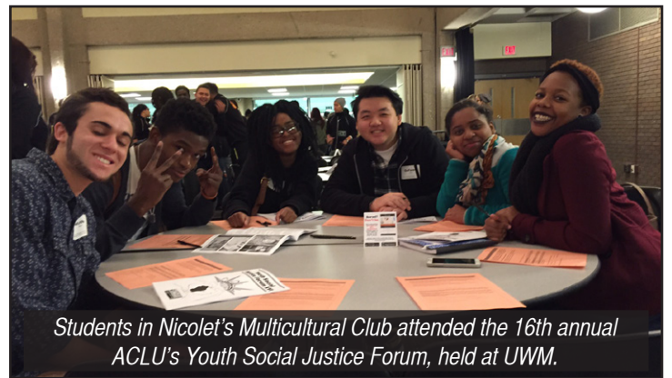
Students in Nicolet's Multicultural Club attended the 16th annual ACLU's Youth Social Justice Forum, held at UWM.