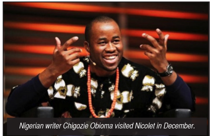
Nigerian writer Chigozie Obioma visited Nicolet in December.

The Foundation looks forward to continue fulfilling grants for teachers to implement exciting and impactful projects such as these. We are currently in the midst of our annual appeal. We hope you will join us in making a difference in the classroom and the future success of our students by visiting http://www.nicolet.us/families/foundation.cfm and clicking the DONATE button.