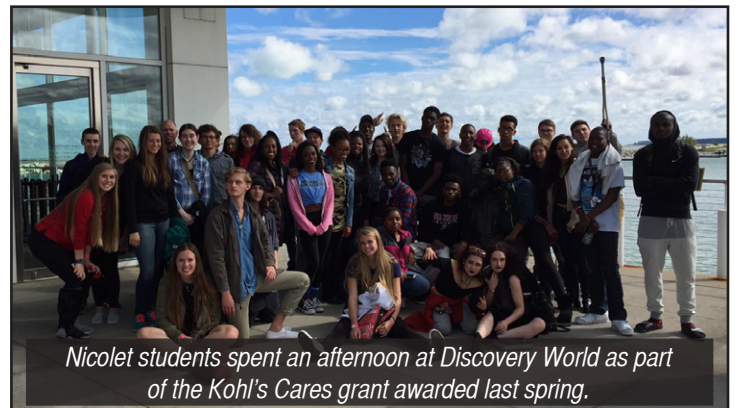
Nicolet students spent an afternoon at Discovery World as part of the Kohl's Cares grant awarded last spring.