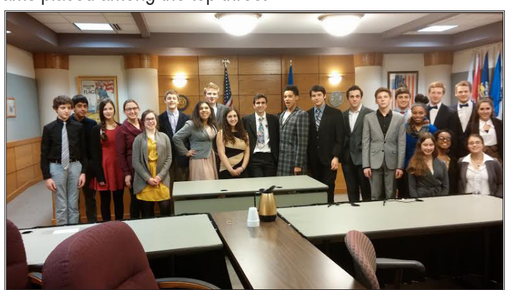
Nicolet Mock Trial Teams