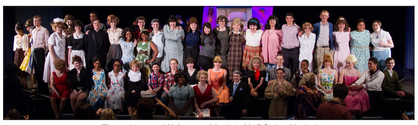
The entire cast of Hairspray, Nicolet's 2015 Spring Musical