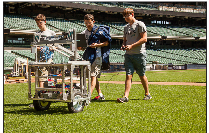
Nicolet F.E.A.R. members have been preparing the team's robot to throw out the first pitch at Miller Park on September 6.

The next step? Being chosen to throw out the pitch at the Brewers game! Nicolet is proud to have the team represent the school and F.E.A.R.'s robotic achievements. Way to go, Robotics Team!