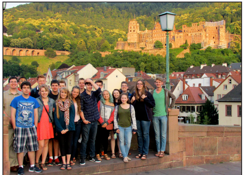
Nicolet students in Heidelberg with the castle in the background.

Nicolet looks forward to welcoming the German students to the United States in early September!